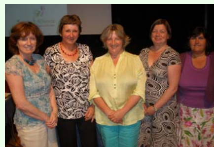
The Surrey Early Support Coordinators